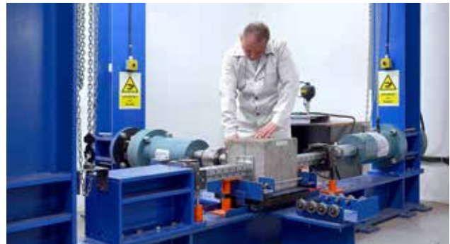
Inhouse testing lab

We employ 1,300 people in Europe. We are also represented in Europe and in large parts of the world such as Africa, the Middle East, the USA and South America with an extensive distribution network. No matter where you are, as a global player we are always close at hand.